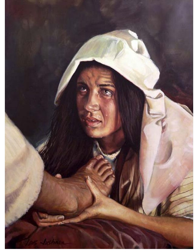
"She was forgiven many, many sins, and so she is very, very grateful. If the forgiveness is minimal, the gratitude is minimal." Luke 7:47 The Message